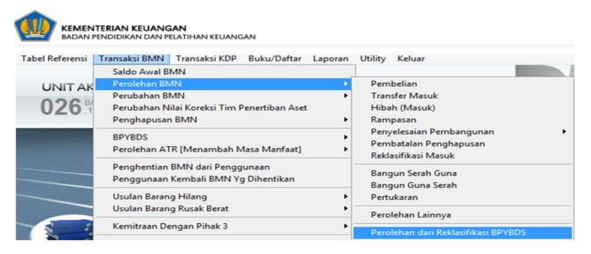
Figure Source 1: SIMAK BMN <a href="https://djpb.kemenkeu.go.id/portal/id/application-simak.html">https://djpb.kemenkeu.go.id/portal/id/application-simak.html</a>

SIMAK-BMN is carried out through a series of procedures, both manual and computerized, involving source documents such as SP2D/Contracts/BAST/Receipts, accounting organizations and accounting processes in order to produce various outputs required for both management and accountability of BMN such as Daily Transaction Details and BMN asset balances. The BMN acquisition transactions in the Simak BMN Application provide information about the sources of asset acquisition which must be recorded by the SU PSA work unit as shown in the SIMAK BMN application menu as follows: